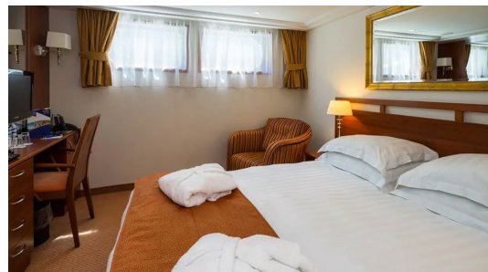
Window stateroom – lower (Piano) deck