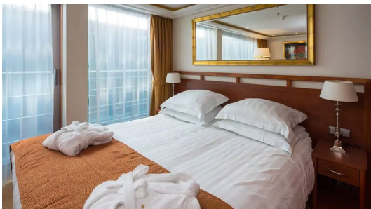
French Balcony stateroom – middle & upper deck