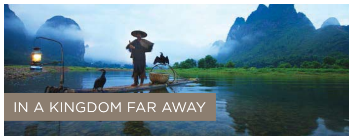
IN A KINGDOM FAR AWAY

Prepare to discover this land of dragons and emperors with this spellbinding journey showcasing China's extraordinary wonders. From the ancient relics of Beijing and Xi'an to the idyllic beauty of Guilin and the bright lights of Shanghai, you'll experience the stunning contrasts of this dramatic land. Tour the Forbidden City, Temple of Heaven and The Great Wall of China. Meet the Terracotta Warriors, raft the tranquil Li River and see otherworldly karsts.