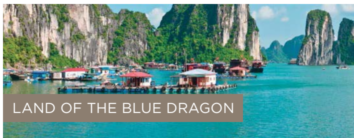
LAND OF THE BLUE DRAGON