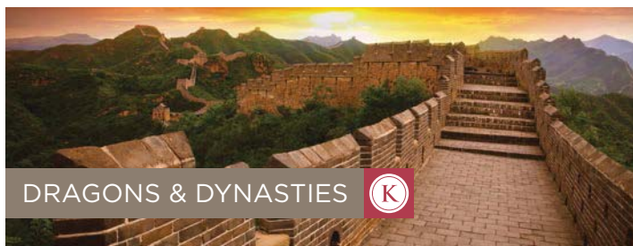
DRAGONS & DYNASTIES

This all-encompassing adventure puts the very best of Southeast Asia at your fingertips. Discover the timeless worlds of Thailand, Laos, Vietnam and Cambodia on this private guided journey. Visit ancient temples, Buddhist caves, hill tribes and floating villages. Enjoy Thai massages, trek through forests on elephant back, navigate underground tunnels and behold relics of the once mighty Khmer civilization.