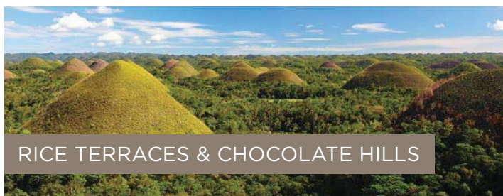
RICE TERRACES & CHOCOLATE HILLS

Delve into dynasties past as you cruise the timeless waters of the Yangtze into the heart of China with this classic private guided tour. Discover sophisticated Shanghai, behold the ancient relics of Xi'an and witness centuries past in Beijing. With enchanting cultural traditions, terraced hills, ancient temples, Imperial treasures, the Terracotta Warriors and The Great Wall, an abundance of riches await, woven together with carefully selected hotels.