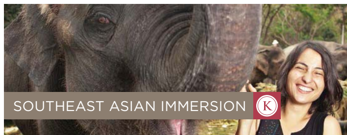
SOUTHEAST ASIAN IMMERSION

Our most popular customizable tour of Vietnam, you'll explore colonial Hanoi, cosmopolitan Ho Chi Minh as well as stunning Halong Bay and charming riverine Hoi An. A land of ancient pagodas, picturesque floating villages, soaring rock formations and dramatic history, you'll fall under her spell. Enjoy a cycling tour of Cua Dai beach, culinary courses, explore the historic Vietnam War-era Cu Chi Tunnels and more, while enjoying world-class hotels.