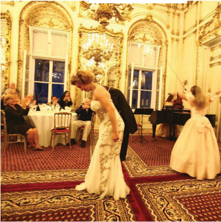
Music fills the air throughout your cruise... including during an exclusive and unforgettable Imperial Evening in a private Baroque palace in Vienna!