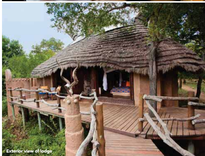
Exterior view of lodge