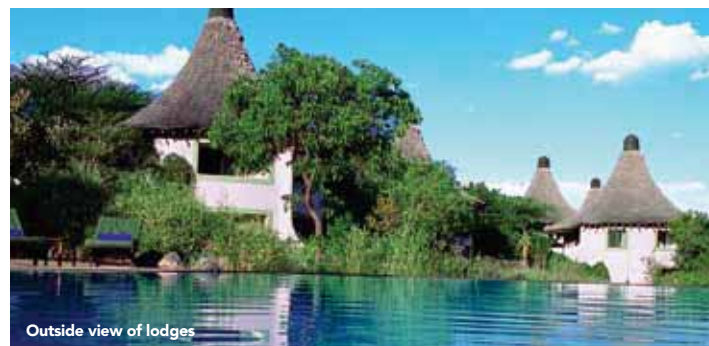
Outside view of lodges

Lake Manyara Serena Safari Lodge is perched on the edge of the Mto Wa Mbu escarpment with one of the greatest views over the Great Rift Valley and Soda Lake. This spectacular setting is renowned for its birds of prey and famous tree-climbing lions. The lodge glows with tranquility and was inspired by the area's abundant bird life. Accommodations are housed in individual thatched buildings. The lodge's 67 bedrooms and stunning swimming pool provides exceptional views of Lake Manyara.