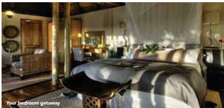
Your bedroom getaway

Situated on the banks of the fabled Stolen River in Botswana, the charming Savute Safari Lodge accommodates just 24 guests in 12 private timber and thatched chalets. All of these suites have private decks, combined bedroom and sitting areas and en-suite facilities. The sitting area, library and cocktail bar are situated in an exquisite thatch and timber main building. Savute boasts a viewing deck, an al fresco dining area and swimming pool, which is the ideal place for watching game at the waterhole. These features set the lodge apart from other safari destinations. Game drives in open-air vehicles are conducted in the Savute area, including the famous Savute Marsh.