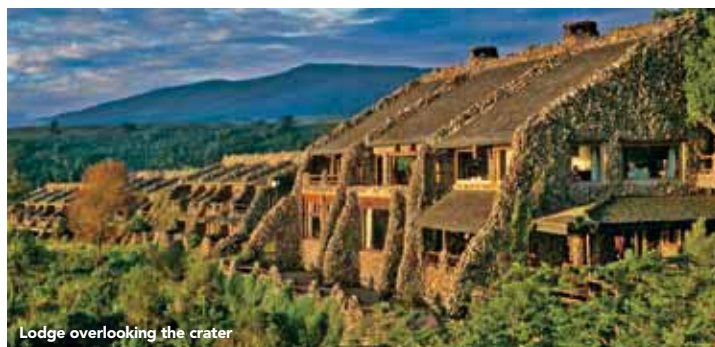
Lodge overlooking the crater

Perched on the rim of the crater wreathed in morning mist and camouflaged in river-stone, the Ngorongoro Serena Safari Lodge is a triumph of ecological and architectural fusion. While affording endless vistas over the crater, the lodge's buildings hug the crater rim. The interior blends the concentrated hush of a game-viewing hide with the charcoal images of a prehistoric cavern. Lit by flaming lanterns and decorated with iron spears and intricately carved Maasai artifacts, the Lodge creates a warm and inviting setting. The 75 rooms have private terraces with uninterrupted views.