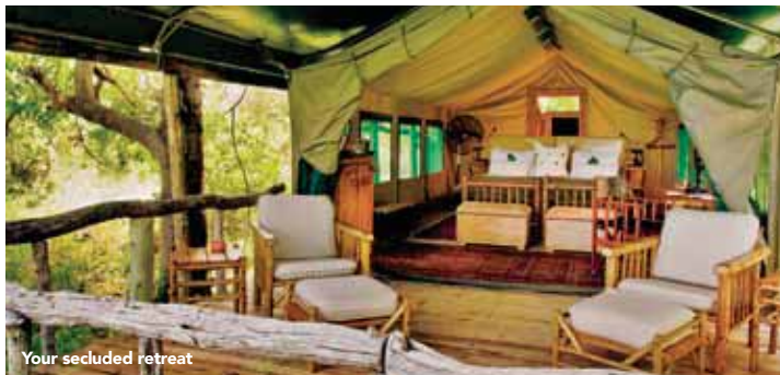
Your secluded retreat

Camp Okavango is situated in the beautiful Okavango Delta on the private and remote Nxaragha Island. For guests seeking a true water experience in the heart of the Delta, Camp Okavango is the place to be. It is a bird watcher's paradise that is ideal for guests seeking a quiet and secluded retreat. Camp Okavango consists of 12 luxury east African-style safari tents, each with en-suite facilities and private sun decks. The lodge can accommodate a maximum of 24 guests and has an elegant thatched main building and dining room that leads onto an expansive open-air patio for evening dining around the open boma.