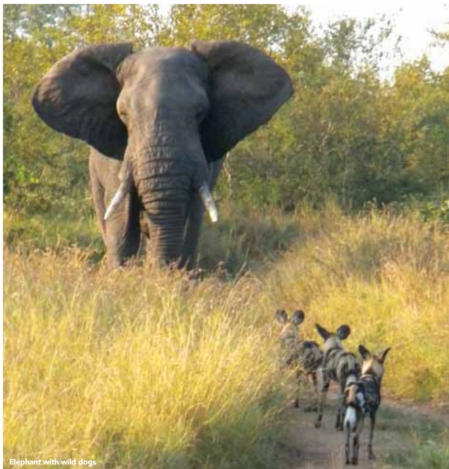
Elephant with wild dogs