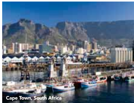
Cape Town, South Africa