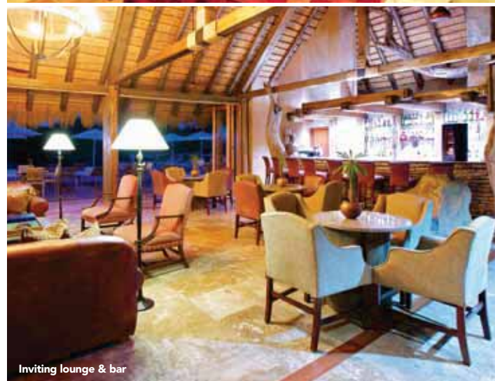
Inviting lounge & bar