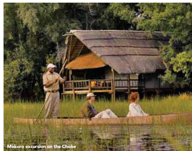
Mokoro excursion on the Chobe

*Note: There are strict luggage restrictions on all small charter flights. Max 44 lbs (20kg) luggage per person (soft bags with no frame or wheels). All lodges in Botswana offer complimentary laundry services.