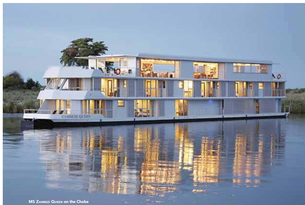
MS ZAMBEZI QUEEN on the Chobe