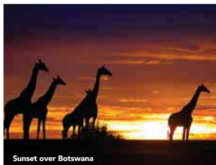
Sunset over Botswana