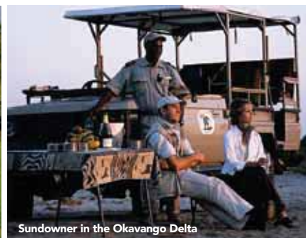
Sundowner in the Okavango Delta