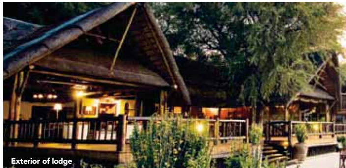
Exterior of lodge

Voted "Botswana's Leading Safari" at the 2007 World Travel Awards, Orient Express Eagle Island Camp in the Okavango Delta is the ultimate luxury safari paradise. Situated on Xaxaba Island, the camp overlooks a lagoon that attracts a breathtaking variety of big game and exotic birds. Accommodations at Eagle Island Camp are everything you'd expect from a luxury safari experience. All air-conditioned tents are housed on raised wooden platforms, offering great views, and shaded by a traditional African thatched roof. The large private decks are furnished with easy chairs and a hammock.