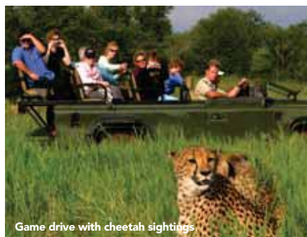
Game drive with cheetah sightings