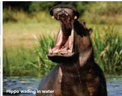
Hippo wading in water