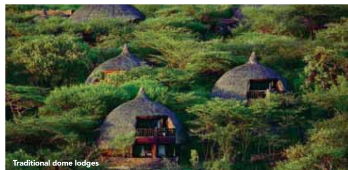
Traditional dome lodges

Winner of numerous awards, set high on a tree-clad ridge and commanding panoramic views, this lodge is the ultimate fusion of traditional African architecture and style. Centrally located adjacent to the Western Corridor and Grumeti River, the lodge offers a series of traditional domed 'rondavels' which are cooled by acacia trees and watered by sparkling streams. The lodge boasts lavish Makonde carvings which decorate both the rooms and stunning domed dining room. Relax at the scenic safari bar with timbered terrace or enjoy a 'vanishing horizon' pool overlooking the Serengeti plains.