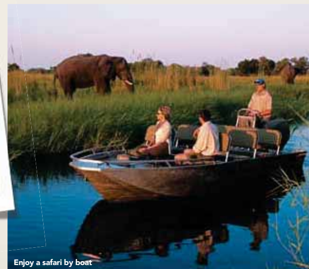
Enjoy a safari by boat