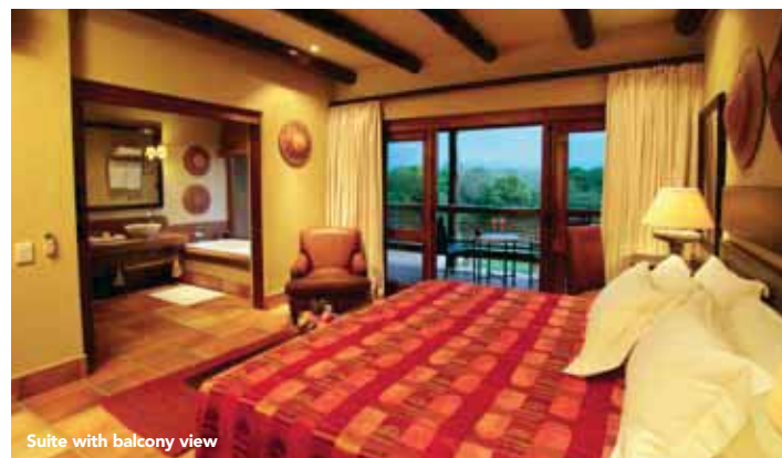
Suite with balcony view

Kapama River Lodge is situated within the private Kapama Game Reserve, and presents the perfect blend of luxurious safari accommodation. The lodge's 64 rooms are stylish, roomy and beautifully positioned along a dry riverbed. Each spacious room features a full en-suite bathroom and terrace with uninterrupted views into the leafy green "Big Five" game reserve. The guest entertainment areas include a large swimming pool, a lounge and bar that curves around the pool. The Rhino Boma dining area offers dining under a low thatch, and has a central open space where a roaring fire gives a glow to evening meals. Buffet-style meals introduce African flavors using fresh local ingredients.