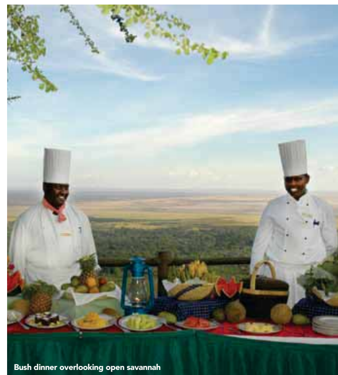
Bush dinner overlooking open savannah