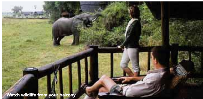
Watch wildlife from your balcony

The Orient Express Savute Elephant Camp offers an oasis-type setting in complete luxury. The camp is known for the herds of elephants which can be spotted roaming nearby. All 12 tents are housed on raised wooden platforms, with private decks and comfortable outdoor lounges overlooking the channel. The tents are perfectly suited to the desert air and are furnished with easy chairs and a hammock, ideal for viewing wildlife. The interiors are luxuriously appointed with such comforts as an en suite bathroom, stocked mini bar, four-poster bed complete with mosquito netting, discreet air-conditioning and an in-room safe.