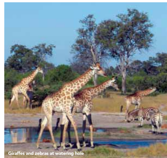
Giraffes and zebras at watering hole