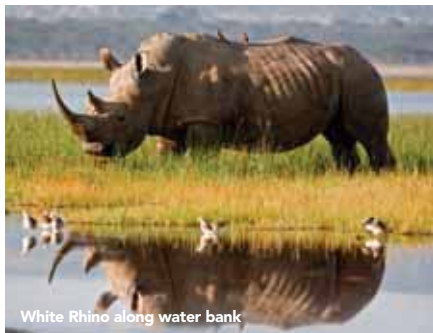
White Rhino along water bank