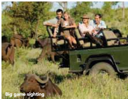
Big game sighting