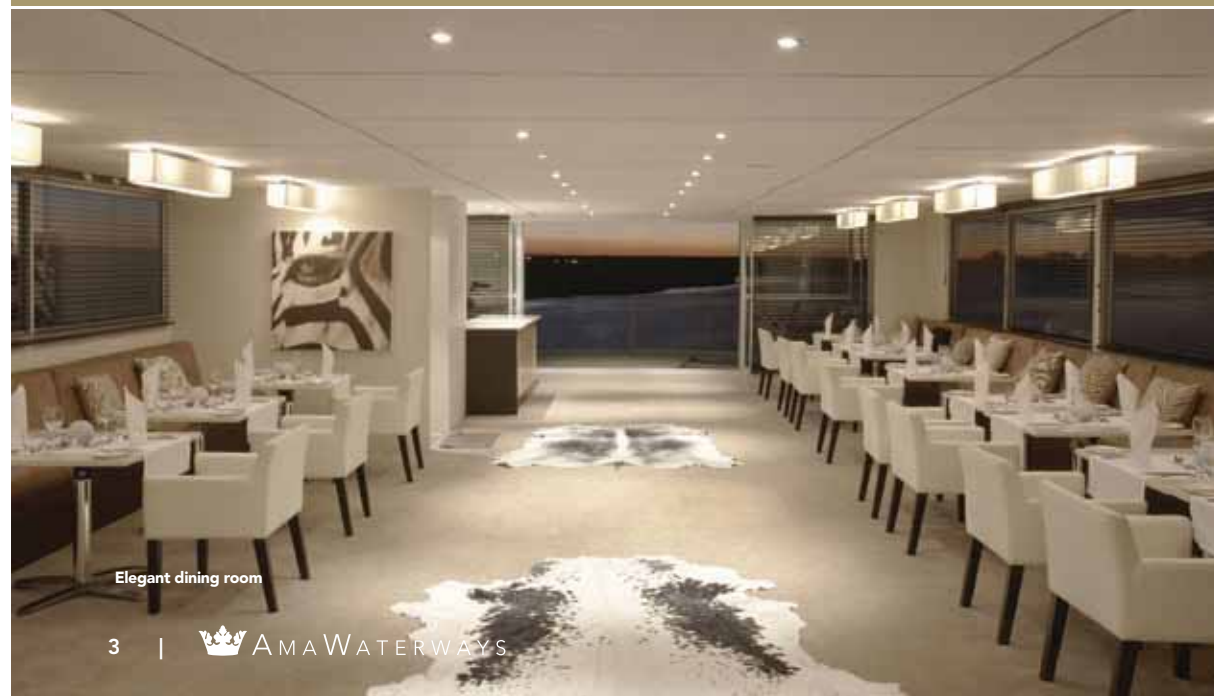
Elegant dining room