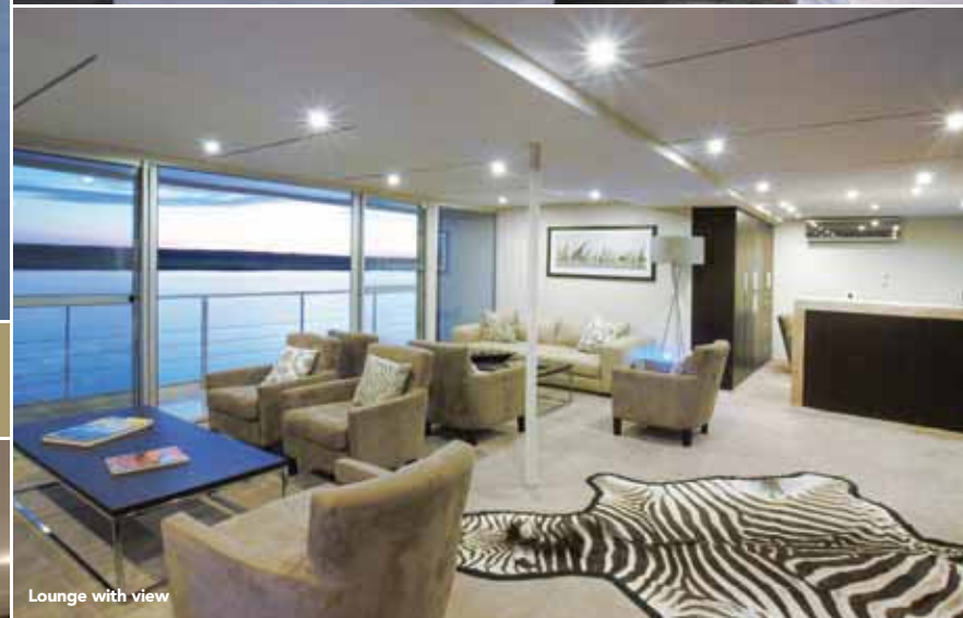
Lounge with view