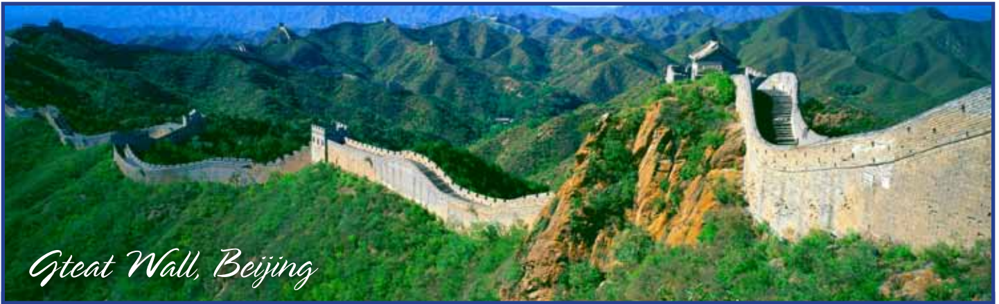
Great Wall, Beijing