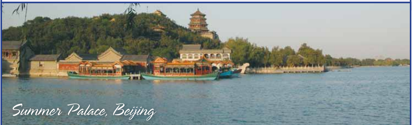
Summer Palace, Beijing